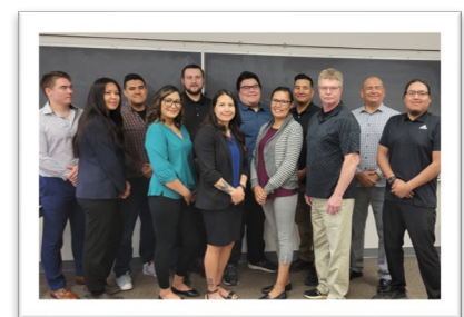
Photos highlighting the tactical training and graduation in Prince Albert, SK.